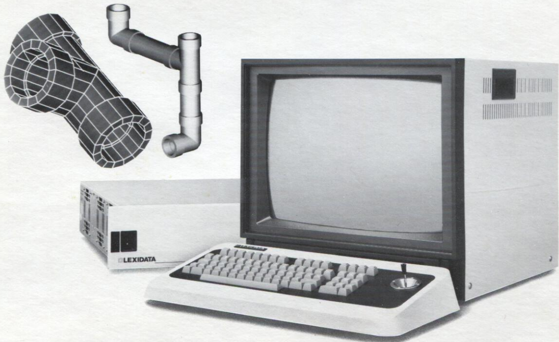
Piping design (above) as displayed on the SOLIDVIEW solid modeling display system.

Lexidata's SOLIDVIEW™ is a revolutionary new technology for the display of solid objects. It is the fastest, most advanced system of its kind. Featuring a special combination of hardware and firmware, SOLIDVIEW achieves its superior performance by uniquely providing local hidden surface removal and local visible surface shading. The result is a solid modeling display system fast enough for interactive applications at an affordable cost.